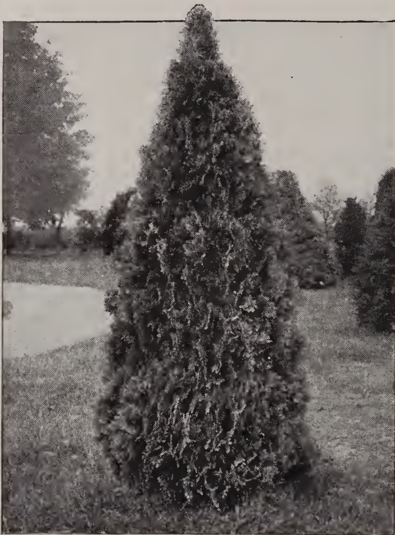
Thuja occidentalis pyramidalis (Pyramidal Arborvitae)